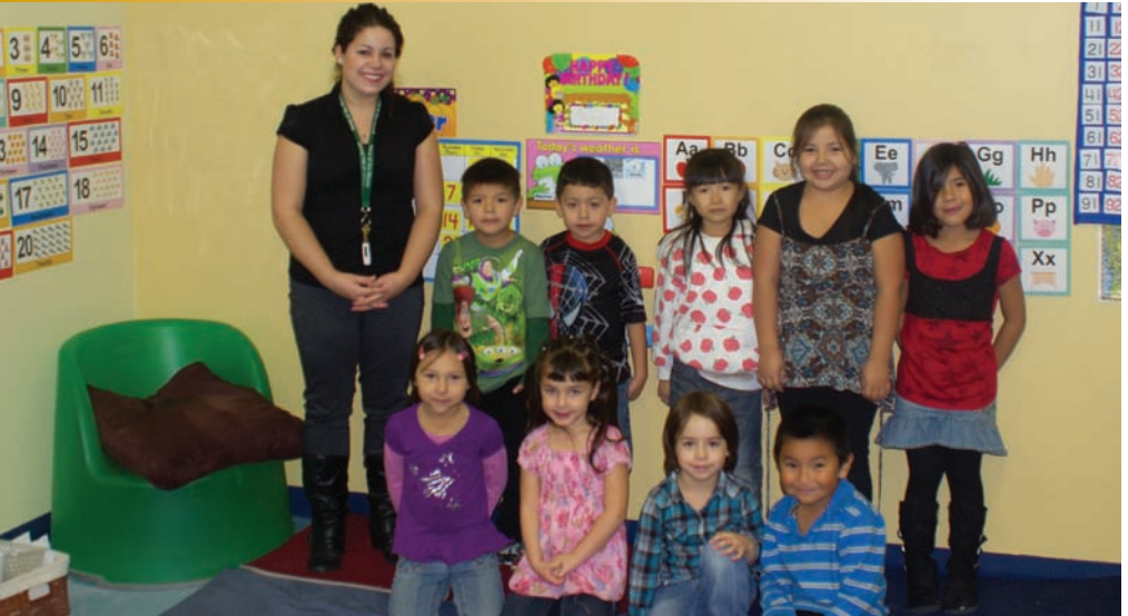
Christian School children with teacher